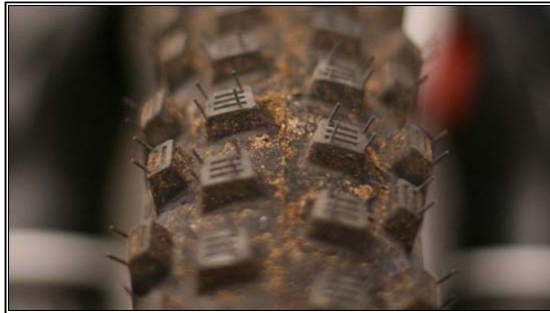
The Datura - 2 months later

Weighing in at 790g for the 2.00 and 890g for the 2.20 - This makes the tyre lighter than many of its competitors on the market. For example, my old friend the Maxxis wetscream has a weight of 1160g in 2.20. I was already questioning if the Geax Datura tyre may have sacrificed strength for weight - only time would tell on this. Lets also not forget the price comparison as you can pick up a pair of Geax Datura for around £30 in the wire version! Bargain!